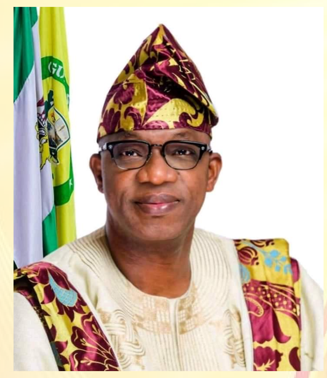
His Excellency Prince Dapo Abiodun, MFR Executive Governor of Ogun State